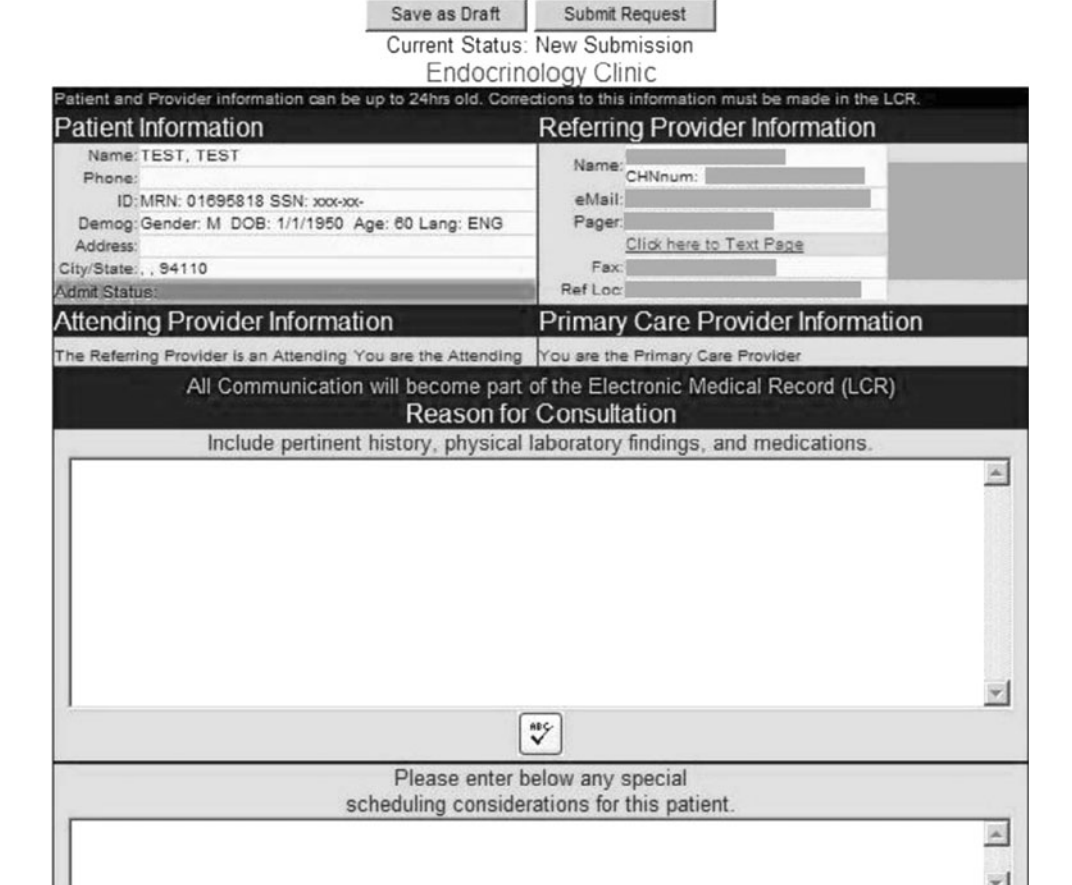
Figure 1. eReferral screenshot.